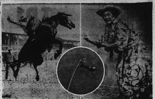
FUN AT THE ORANGE COUNTY FAIR —Some of the highlights of entertainment featured at the 1963 "Hawaiian Holidays" Orange County Fair are shown above. At left, the action of the cowboy is indicative of the thrills, spills, and excitement to be witnessed at the World Championship RCA Rodeo, July 13, 14 and 15. Hilo Hattie, at right, demonstrates the happy attitude of the