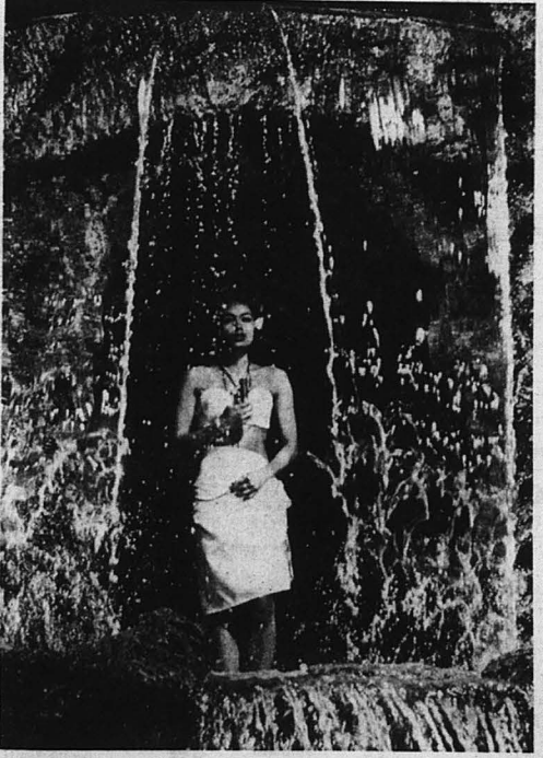
MORE MAGIC — One of the minor magical 'tain' (shown above) which opens to reveal love-locks of the "new" Disneyland tourists and locals will see this summer in the waterfall "cur- one of the new attractions in Adventureland.

Walt Disney personally briefed members of the press and has many television sponsors on the new construction at an after-dark party Saturday night at the park. Disney hunted broadly the "new" Disneyland which will emerge from the two- to three-year building program will be a multi-level affair with "things to do" at ground level, "in the basement" and above the ground. He said the current $7 million program will be financed and constructed over a two-year period. "It is focal point of an all-out campaign to "sell" adults on "Disneyland After Dark."