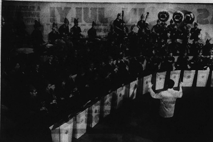
MUSICAL AMBASSADORS — The world-famous, well-traveled Robin Hood Band, stars of a movie called, "Musical Ambassadors," appear in Anaheim, Friday night at 8 p.m. in the Anaheim Greek theatre. Raising the curtain on this summer's